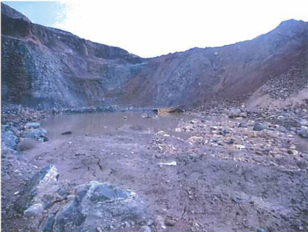
Figure 3 – Bottom of Dump Site Looking Up