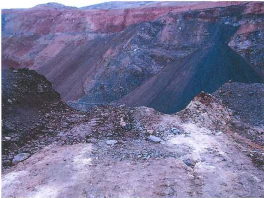
Figure 5 – Dump Site Berm Where Haul Truck Travelled Thru