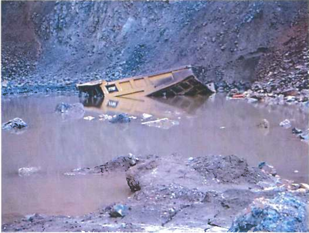
Figure 2 – Driver Side of Haul Truck