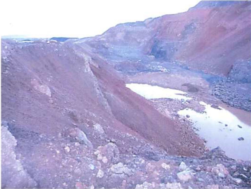
Figure 4 – Top of Dump Site Looking Down