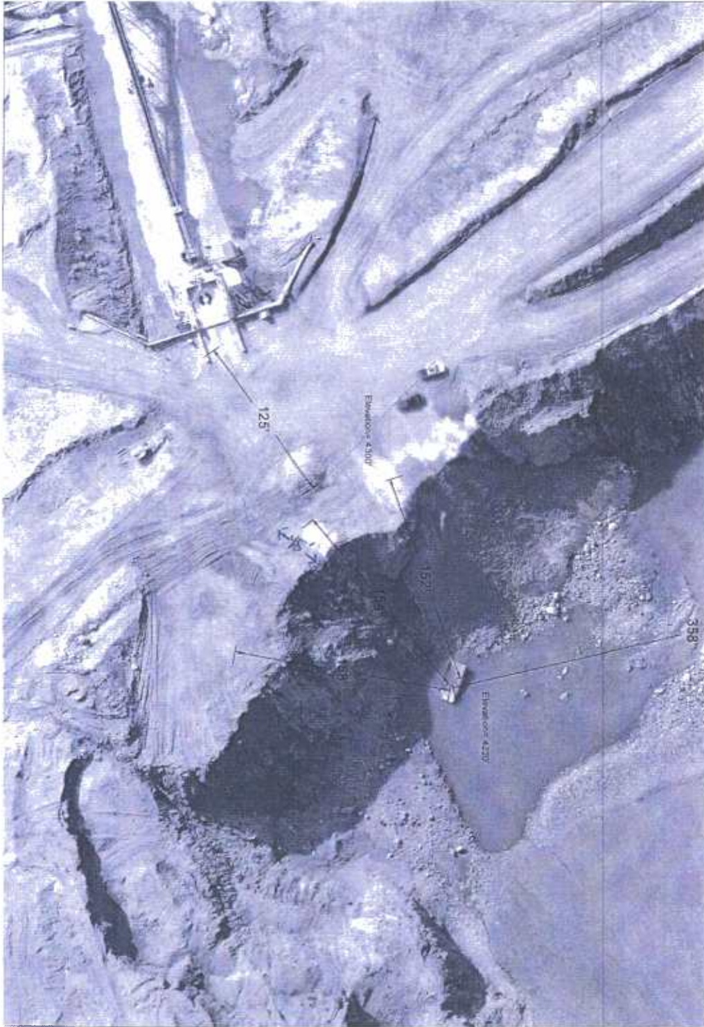
Figure 1 – Aerial Photograph of Accident Scene