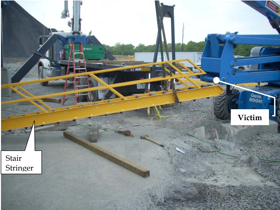
Photograph showing approximate position of the stair stringer and manlift when accident occurred.