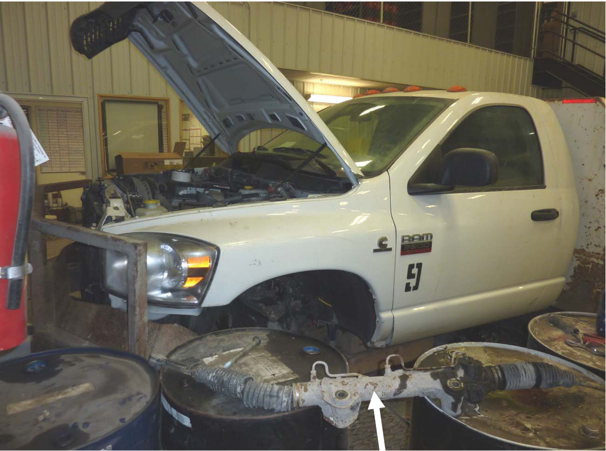
POWER STEERING UNIT TAKEN OFF TRUCK